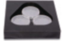
RADPlus™ Petri Dish Holder

RadPlus is protected by Patent No. 6,389,099.