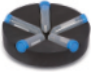
RADPlus™ Vial Holder